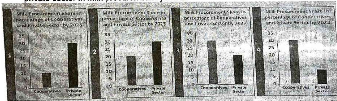
(a) Option 1 (b) Option 2 (c) Option 3 (d) Option 4